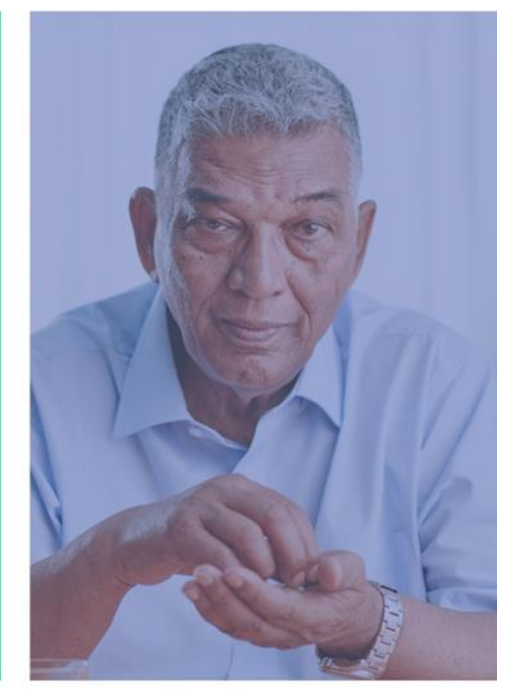
Short Breaks for adults (18 years +) with care and support needs